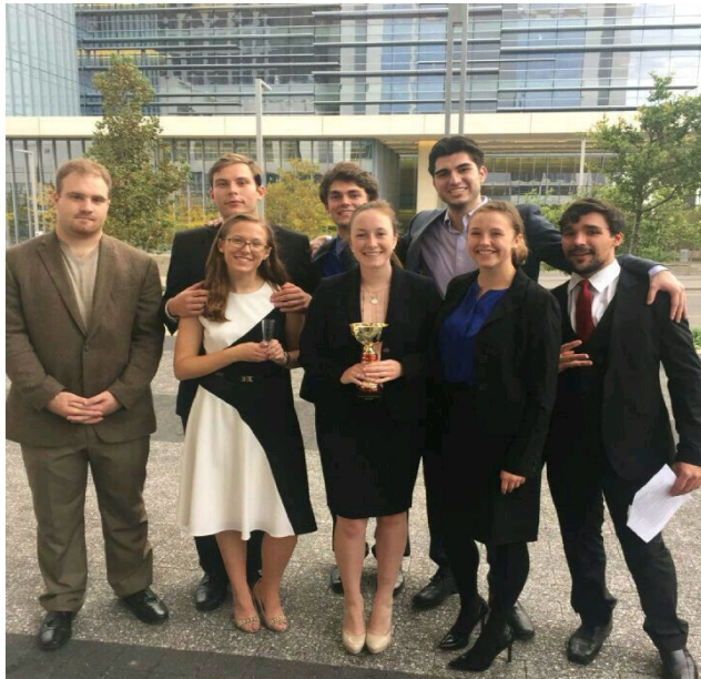
At Ohio State, the Red team won 2nd place with a record of 7-1.