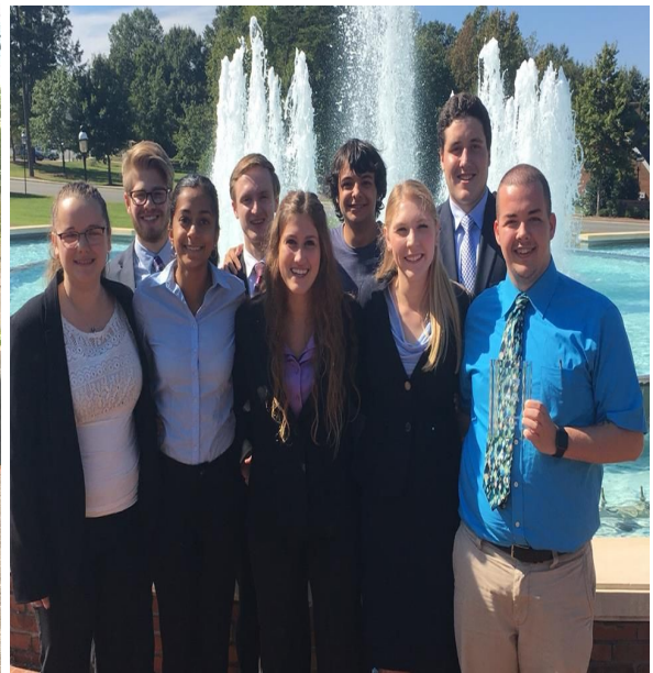
At Elon University, the Blue Team won the Southern Hospitality award!

It's AMTA season and our new teams have been announced!